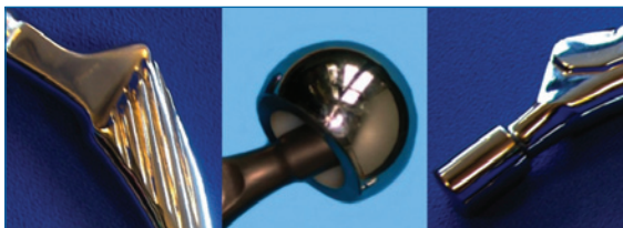
FIGURE 1: Final components

Stainless has been a long time exclusive partner of Aubert & Duval, in specialty innovative stainless steels and cobalt base alloys, using and mastering state-of-the-art re-melting technologies with outstanding process control. The same applies with its sister company, UKAD, integrated from mining and sponge, as the 2 nd world largest producer, to processing