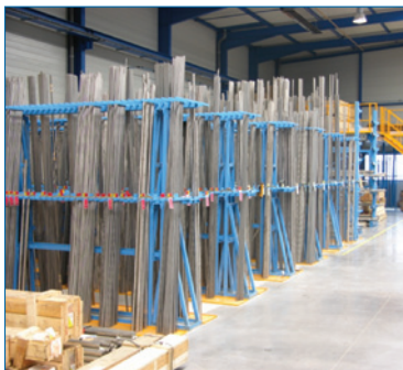
FIGURE 3: Inventory of bars for implants/instruments

with final steps in forging and rolling, offering titanium alloys like Ti6Al4V.