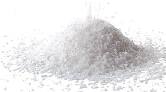
FIGURE 2: Resorbable polymer granulate